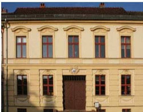
Einstein Forum, Potsdam